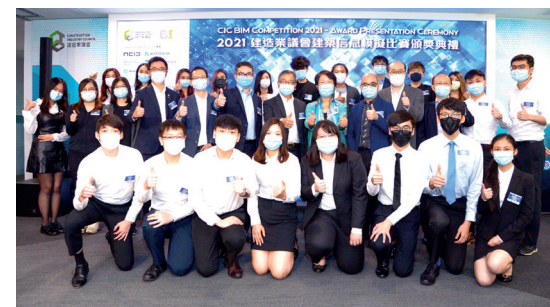
Winning teams and guests celebrate their success at the Award Presentation Ceremony held on 12 June 2021.