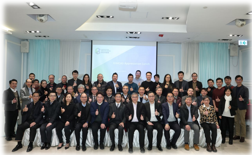
Group photo of BIMCAS members, assessors and course providers contributed to BIMCAS in 2023

An appreciation lunch was held on 24 January 2024 to express CIC's appreciation of the contribution of the assessors towards the certification process of CCBM/CCBC, and the accreditation of course providers organising CCBM/CCBC courses under the BIMCAS. Around 60 assessors and guests joined the lunch.