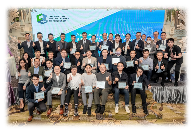
Group photo of Building Information Modelling Certification and Accreditation Board (BIMCAB) members and the assessors who helped for BIM assessment panels in 2022.

To give tokens of appreciation for the supports and efforts of assessors contributed to the assessment panels of the CIC BIM Certification and Accreditation Schemes (BIMCAS), an appreciation lunch was arranged on 28 November 2022. More than 40 assessors and guests joined the lunch. We look forward to continuing to work closely with them for the benefit of the BIMCAS and the Hong Kong's construction industry.