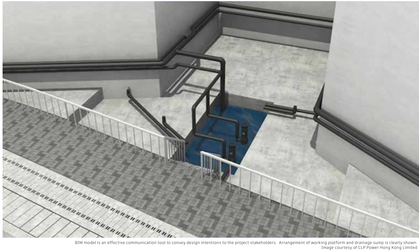
BIM model is an effective communication tool to convey design intentions to the project stakeholders. Arrangement of working platform and drainage sump is clearly shown.