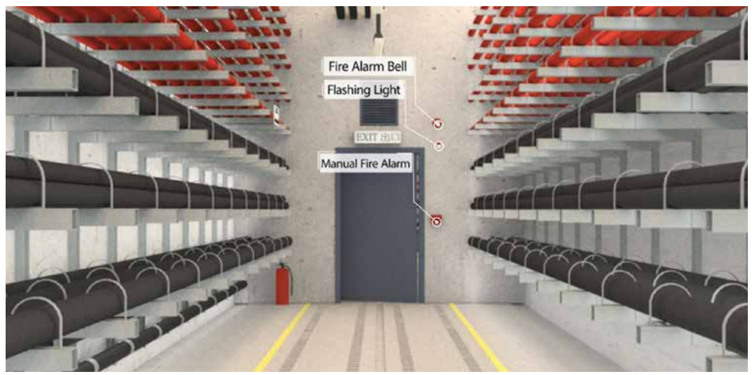
BIM Model provided an accurate sense of presence inside the tunnel that is yet to be built. Improvement to the design can be identified easily prior to the construction.

The Kai Tai Cable Tunnel can accommodate up to 50 cable circuits including four 400kV, six 132kV and forty 11kV cable circuits, and the cables are heavy, each perhaps with the diameter