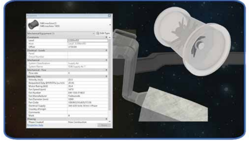
Accurate information of the building facility can be retrieved quickly in the BIM model for the facility management team.

as large as an arm. With the BIM virtual 3D models, the engineers and designers optimised the cable alignment, enhancing cost effectiveness and minimising spatial conflicts. "When turning a corner, we had to make sure there would be enough radius for the thick cables," says Ir Ip. "As the cables are quite heavy, we also used BIM to help us install them in a safer way."