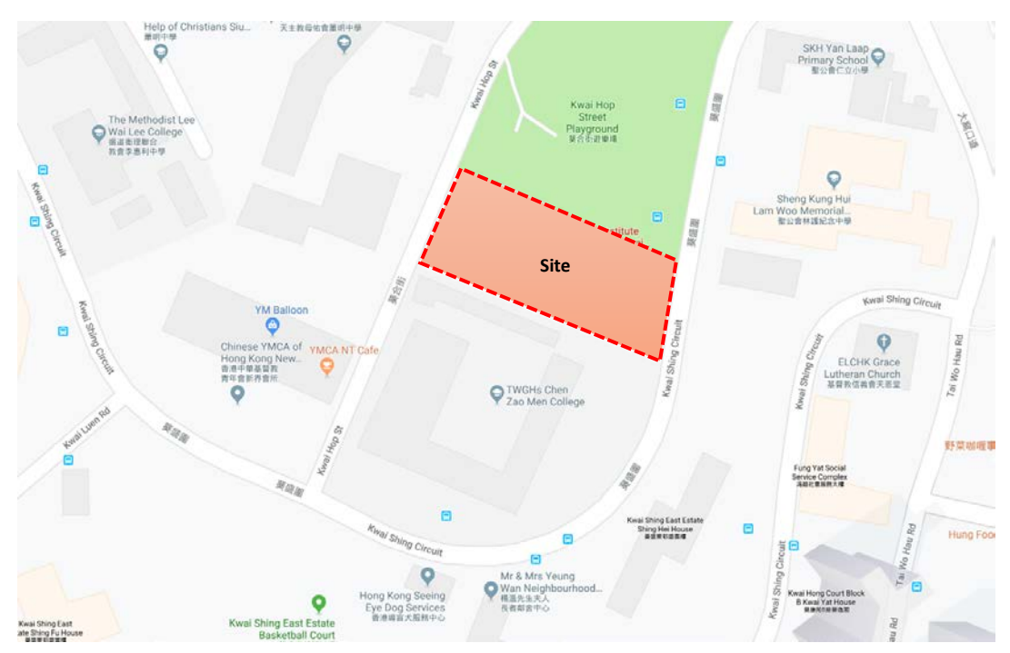
Enlarged Location Plan

Successfully registered participants will be provided with 2D CAD drawing in .DWG format indicating the site boundary and the basic layout of the site surrounding context.